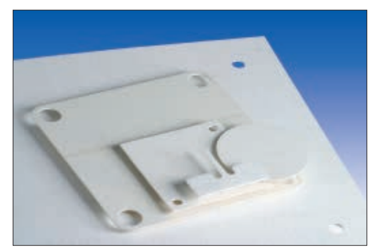
Seitz P-series depth filter sheets are available in a wide range of shapes and sizes.

Important Note:- Use of this product in a manner other than in accordance with Pall's current recommendations may lead to injury or loss. Pall cannot accept liability for such injury or loss. Because of developments in technology, these data and/or procedures are subject to continual review and update. Please contact Pall for additional information.